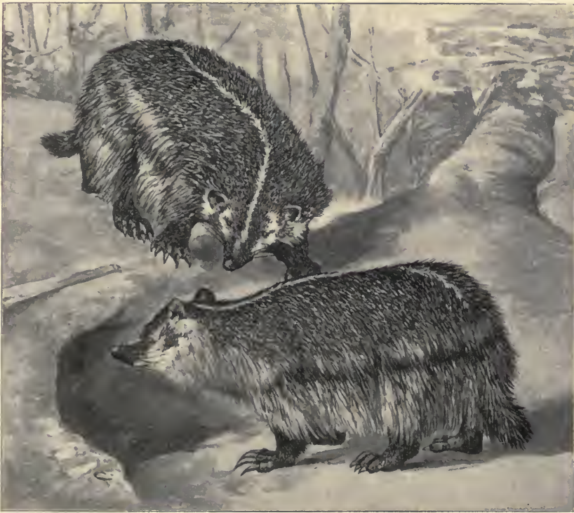
FIG. LIV. TAXIDEA T. BERLANDIERI. BERLANDIER'S BADGER.